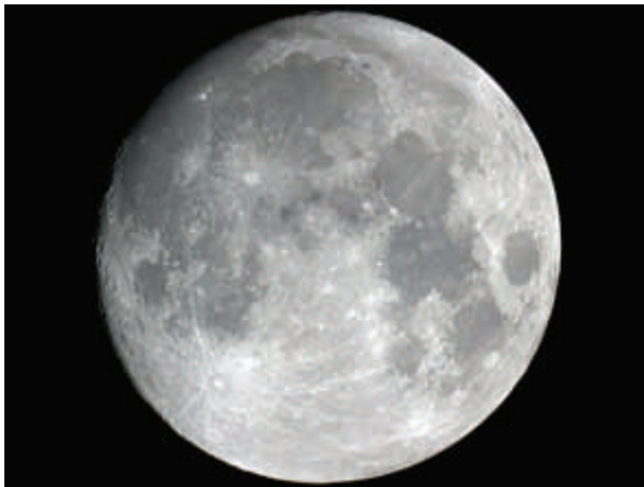
The Waxing Gibbous Moon as photographed through our 12" telescope in Owl Observatory.

Sometimes our meetings feature special themes, including "Gadget Night" in July, and "Astrophotography Night" in October. The "Perseid Potluck Picnic" replaces the August meeting, and in December we hold our annual meeting and holiday party.