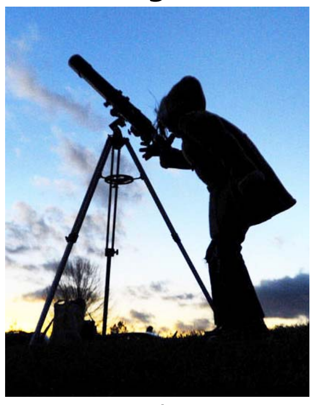
at the Kalamazoo Nature Center