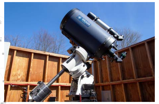
The Meade 16" Schmidt-Cassegrain Telescope.

The heart of the observatory are our new 16" Schmidt-Cassegrain and 4" refracting telescopes, both mounted on an ultra-stable Astro-Physics 1600GTO German equatorial mount. The mount is computer-controlled, permitting quick, automatic access to thousands of stars, star clusters, nebulae, and galaxies. The observatory is open during every Public Observing Session.